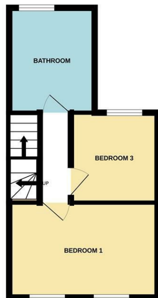
1ST FLOOR 290 sq.ft. (26.9 sq.m.) approx.